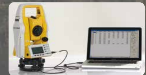
Data Transfer Software